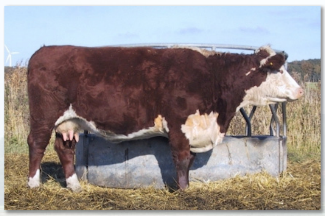
Moeskaer Tracy 906

Moeskær Tracy 906 might be our best breeding cow. She just keep producing the great ones every year. Her calves are always being picked out as the top favorites by visitors to the herd, for their tremendous quality and style. All her calves have either sold to top breeders or been retained in our herd. One daughter was Supreme Danish National Champion at the 2007 World Tour. Her 2010 calf sold England at 4 month of age.