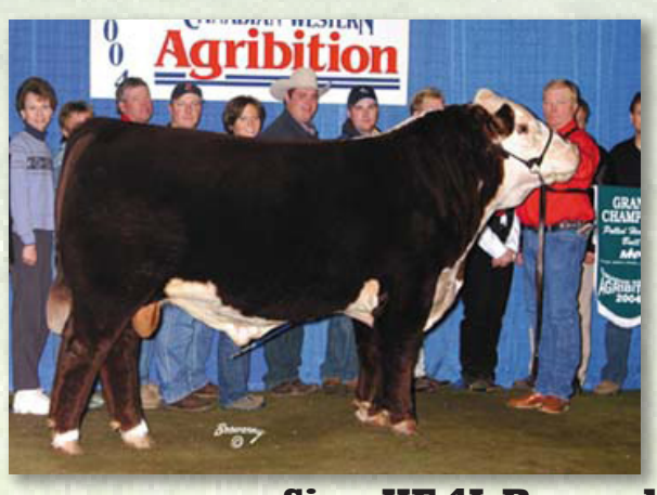
Sire: HF 4L Beyond