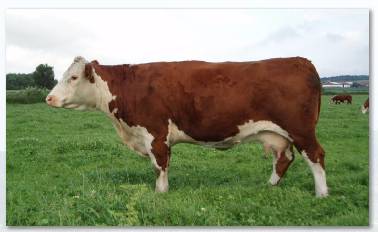
Moeskaer Fancy April 1084

Moeskær April 1084 is truly one of the greatest young cows in our herd. She was a show winner and now a tremendous producer. April 1084 was Champion Hereford and Supreme Beef Champion Female at the Gammel Estrup Show and her two full brothers Moeskær Argon and Moeskær Mentor have dominated the Shows in Denmark for several years winning countless champion titles including Danish National Champion Bull.