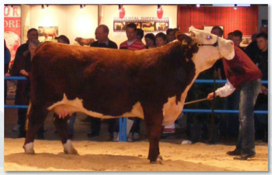
Moeskaer Kashmir 1086

Moeskær Kashmir 1086 is one of our most popular and complete females. She is two time Danish National Grand Champion Female at Agromek as a calf and again as a cow.