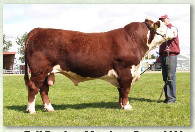
Full Brother: Moeskaer Argon 1090

Star Sinclair 9E FCC 9E April 46G Kilmorlie PPH 23B April 722D