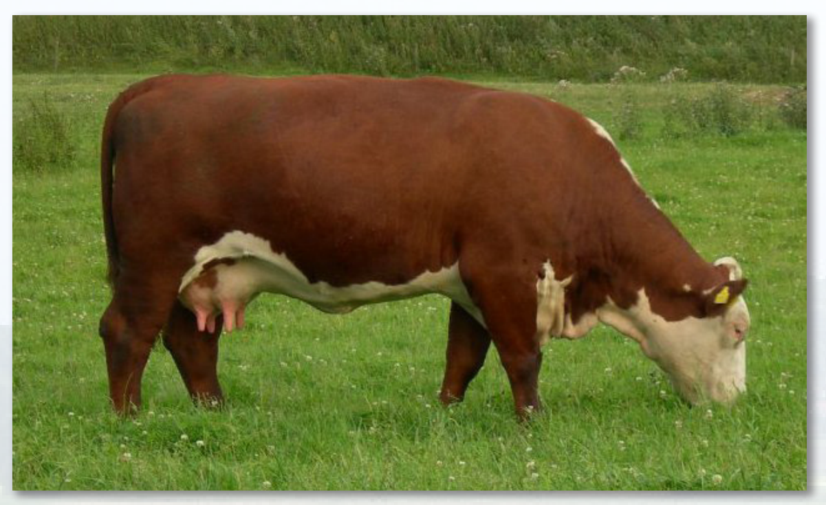
Moeskaer Kema 1155

Kema 1155 is one of the best females in our herd. She comes from an extremely consistent cow family in Canada and the Haroldson herd. Her Dam Kema 95K was Grand Champion at the Canadian Western Agribition in 2002. Kema 1155 herself was calf champion at the Danish National Show. Kema's pedigree is back by two bulls that have had a large impact on the Hereford breed in North America Beyond and Headliner have produced several top animals. We are delighted to be able to offer that same impact now to you for your herd.