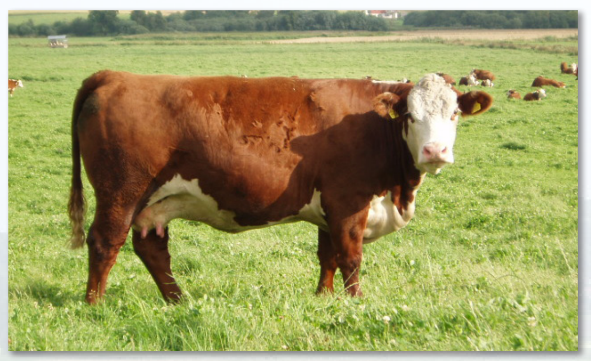
Moeskaer Etta 1154

The Ette cow family have played a key role in the role in the Hereford breed around the World. Ette 2E dam of Moeskaer Ette is also the dam of Canadian Western Agribition