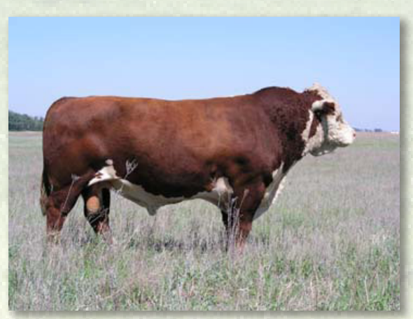
Sire: Remitall Govenor 236G

Kilmorlie Delivernce ET 80U Bar75 Krystal 80U 10Z Bar75 Lady 26S 25X