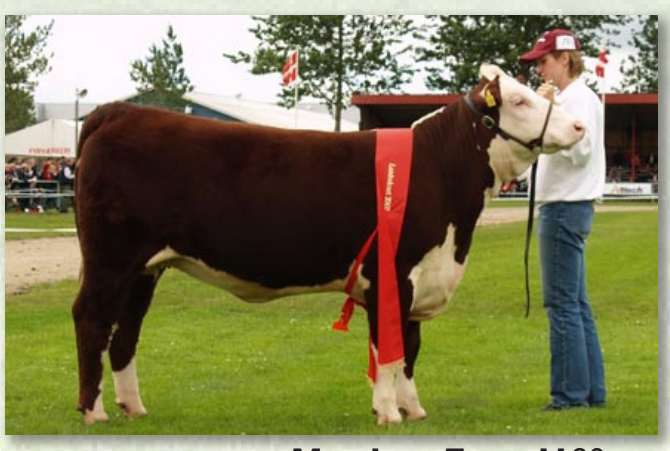
Moeskaer Tracy 1130

WS Bond 3306 1ET Moeskær Tracy 647 ONHH R Tracy 21T 55Z