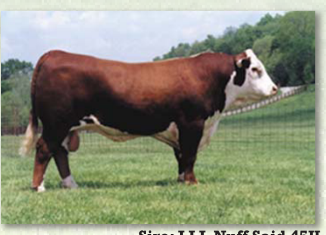
Sire: LLL Nuff Said 45H

Remitall Keynote 20X Remitall Aretta 51A Remital Wilma 37W