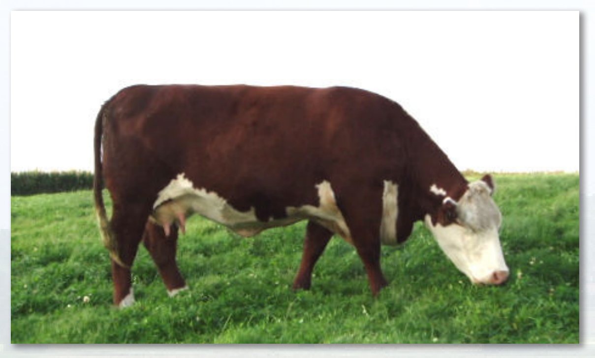
Moeskaer Krystal 1062

Crystal is a young top-daughter by Remitall Governor who is one the top bulls that combines carcass traits, milk and plenty of volume. She comes from strong bloodlines on both sides. Crystal's full sister has won several livestock shows in Canada.