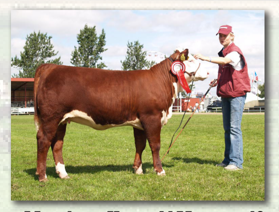
Moeskaer Kema 1155 as a calf

MSU Star Headliner Haroldson's Kema 95K Haroldson's CU Destiny 2Z