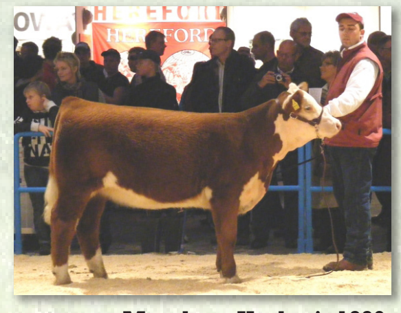
Moeskaer Kashmir 1220