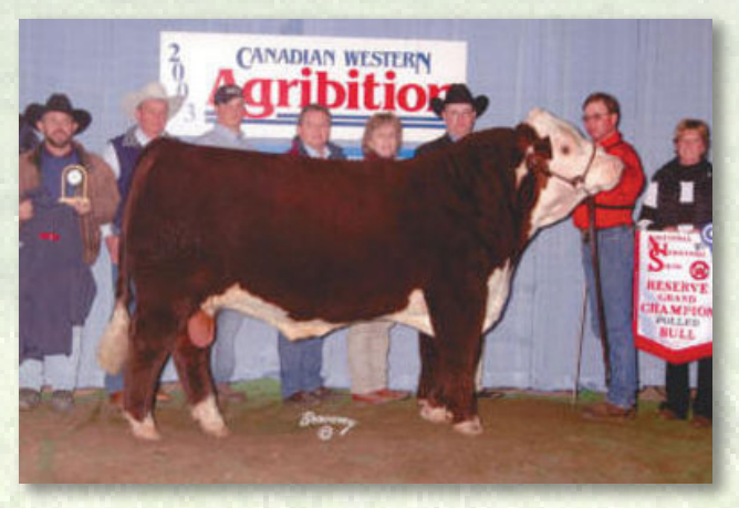
Maternal Sibling: ANL SBS 57G Frontier 4M

BW: 3.7 WW: 42.3 YW: 69.6 Milk: 15.8 TM: 37