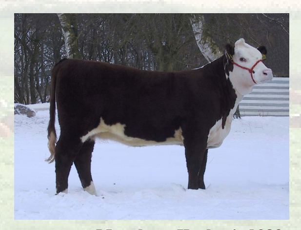
Moeskaer Kashmir 1086

S&S Basic 1G Golden-Oak 1G Kashmir 7K Golden-Oak 2Z Gleam ET 8G